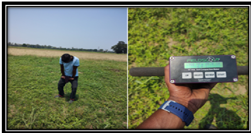
Plate 2: Measurement of cone index on field before test