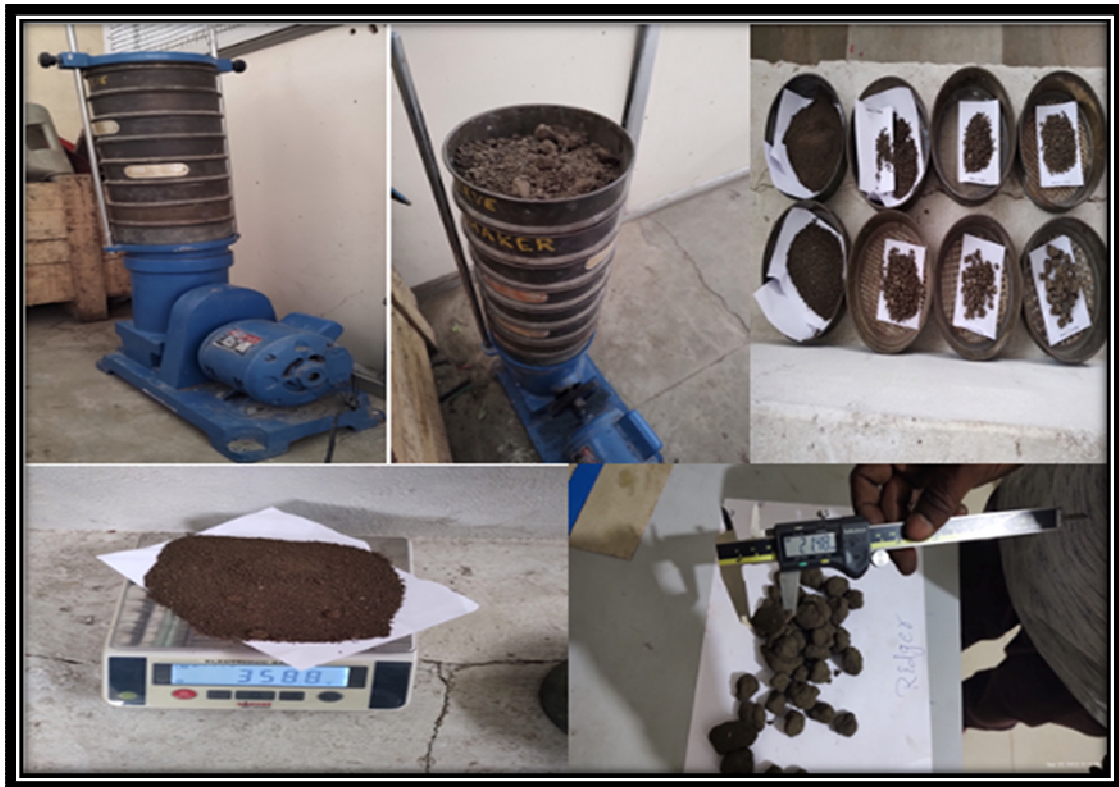
Plate 3: Measurement of mean weight diameter of soil particles

W_i = Fraction of the weight of soil collected from the retained sieve to the total weight of the sample, g.