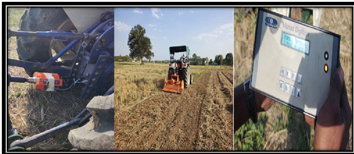
Plate 5: Measurement of torque with torque sensor