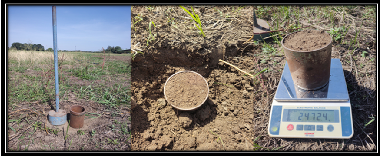
Plate 4: Measurement of bulk density of the soil