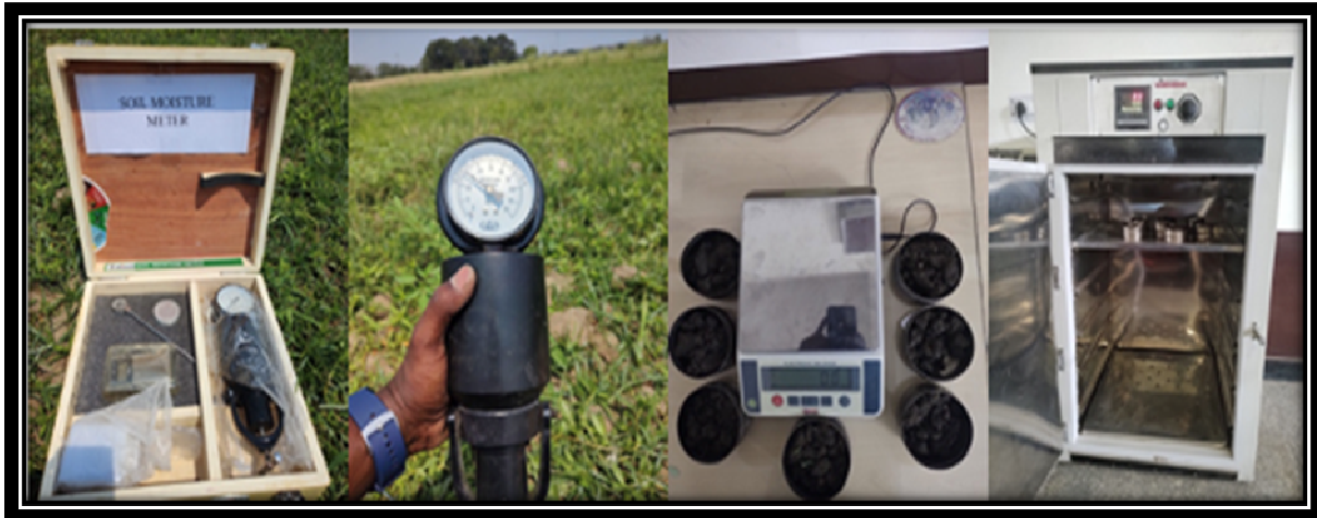
Plate 1: Methods for measurement of moisture content on actual field condition